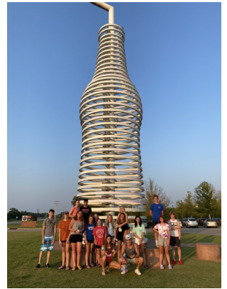
Ignite at Hurricane Harbor -OKC