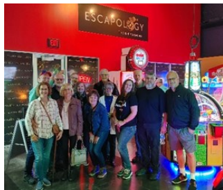
Crescendo Sleuths at "Escapetology" in Wichita.