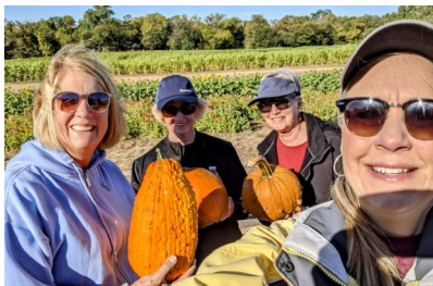
Prayer Walk at P & M Pumpkin Ranch

Tuesday, December 14, 6:30pm. Enjoy an evening of high-spirited fun and connection over dessert. More details to follow. Save the date!