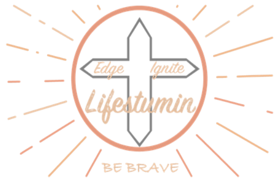
Ignite Paintball Event

24 | Service opportunity at Community Building Thanksgiving- TBA NO YOUTH GROUP – Happy Thanksgiving!