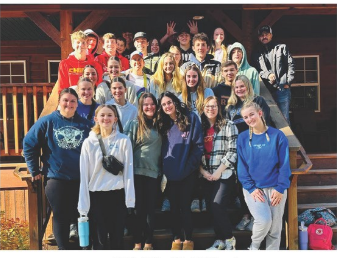
High School Fall Retreat

Come summer 2025, the youth are headed to the great state of TEXAS! We're headed Arlington to serve with a nonprofit organization called Mission Arlington. We'll be staying in a "host church" and leading VBS programs apartment complexes around the city and providing help with any service projects! Please join us in praying over this trip! It will be hard but incredible work! Very practical ways to be the hands and feet of Jesus!